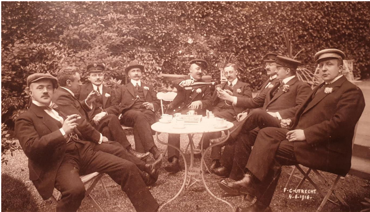
The Kegelclub "Westfalia" Amsterdam