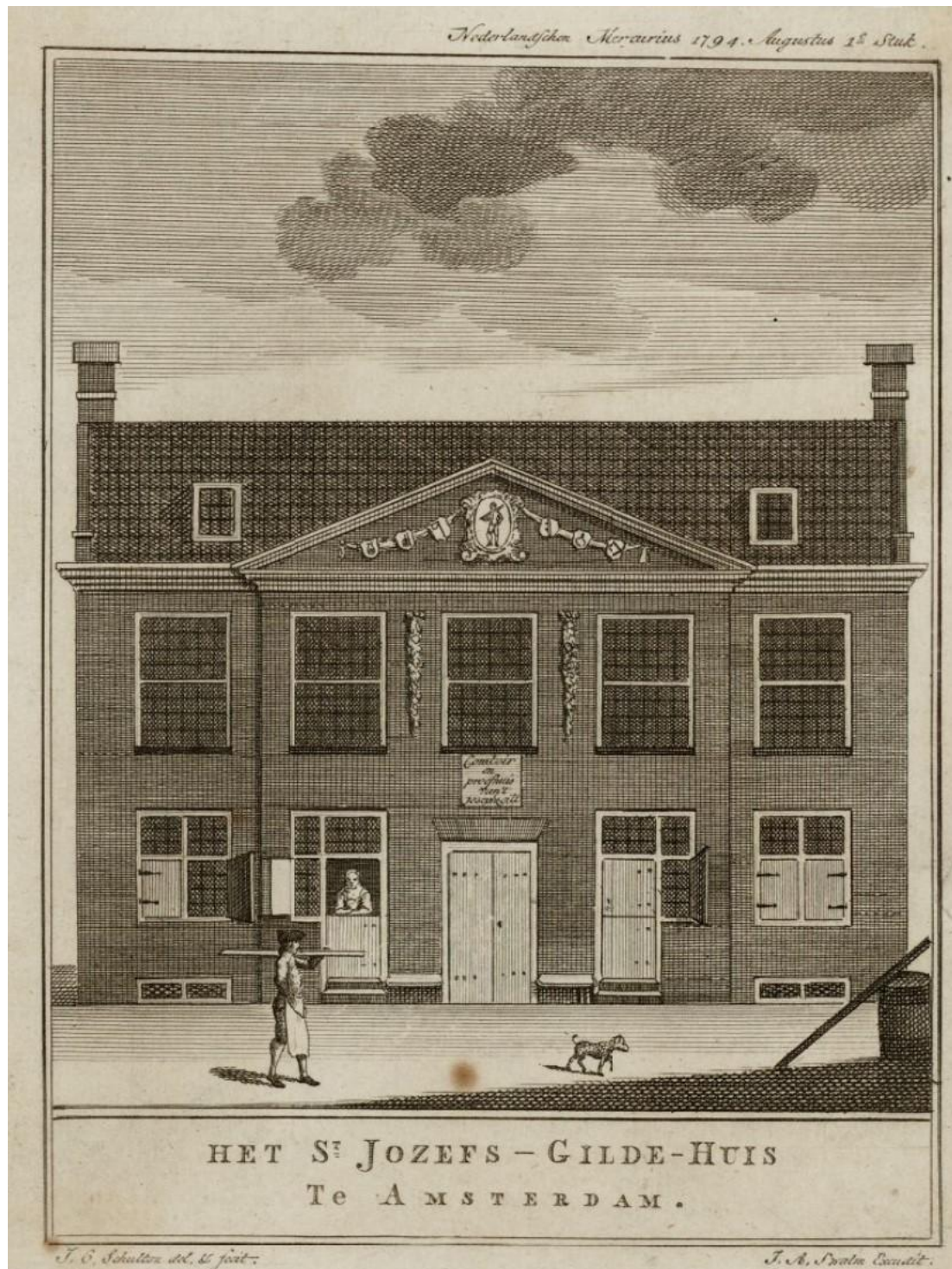
Reguliersdwarstraat 52-54 in 1794

One of the members was to go to Italy for the time being, but got stuck halfway and the next year there was no lady at supper.