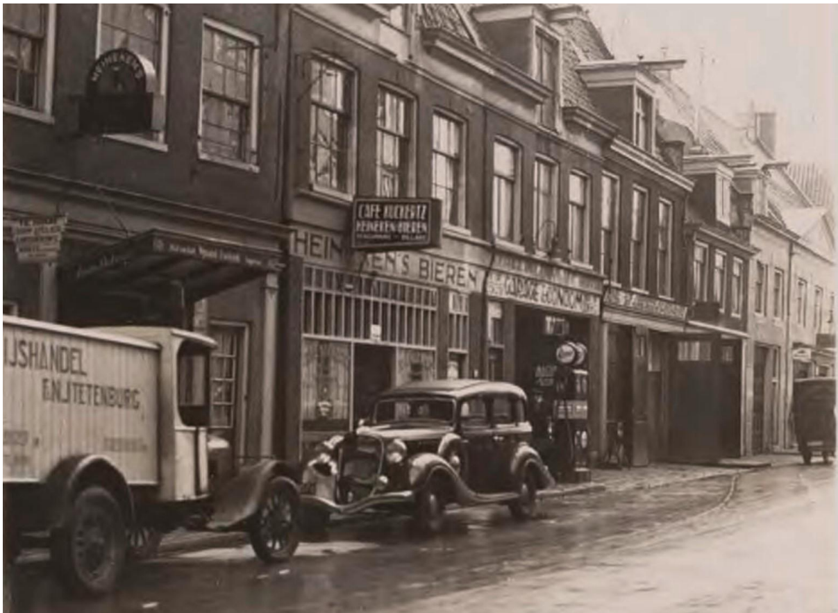
Far right: Zum Franciskaner, Reguliersdwarstraat 54 in 1936

The Treasurer, already present there in other respects, paid him his last respects at the funeral. On the 6th of November a meeting was held in the Franciscan about what would be done in this matter.